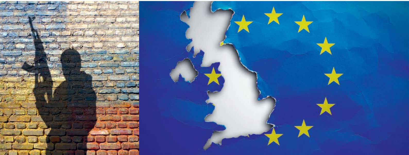
Illustrations du conflit Russie-Ukraine et du "Brexit"